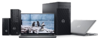
Sustainability on Precision Workstations